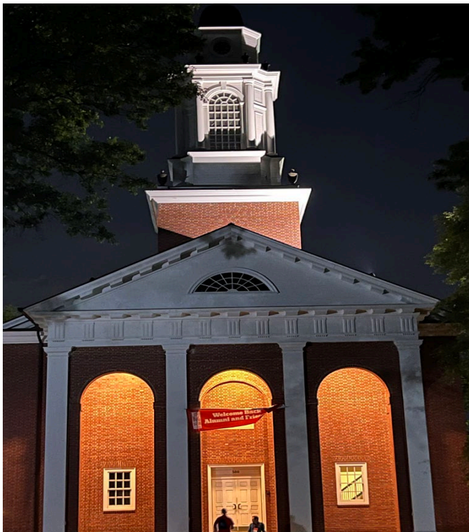
Pioneer Chapel late on the evening of June 3 rd with some alums sharing old memories on the steps.